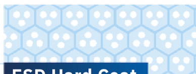
ESD Hard Coat