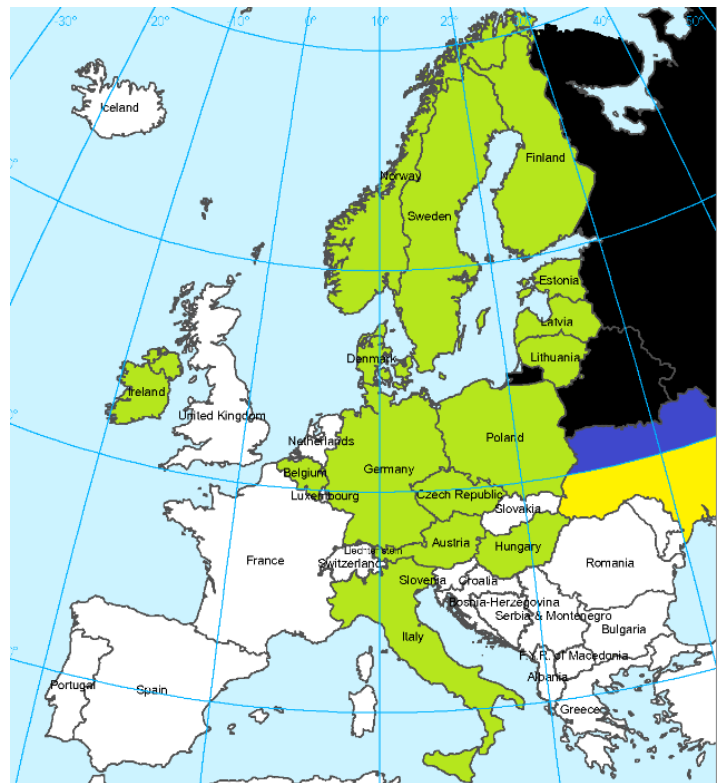
Our presence in Europe!

SANUS greenhouses are fast growing aluminum greenhouse brand in Europe. We ship greenhouses to customers from snowy north of Norway to sunny south of Italy and Malta. Wide range of sizes with glass, polycarbonate or glass walls + polycarbonate roof coverings allows customer to find best fitting option for them.