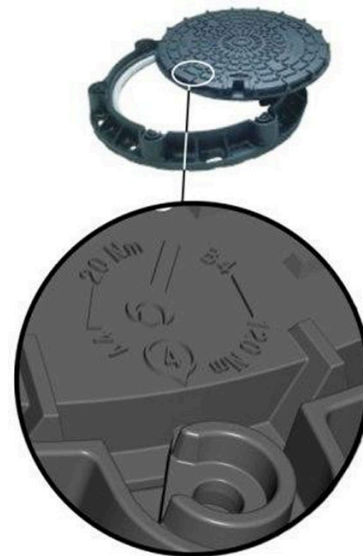
Indication des couples de serrage des clames